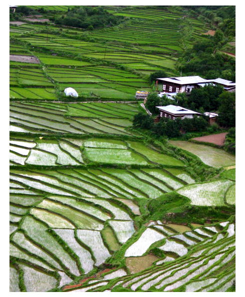
Paddy fields - Paro